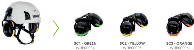
SC1 - GREEN WHP00004