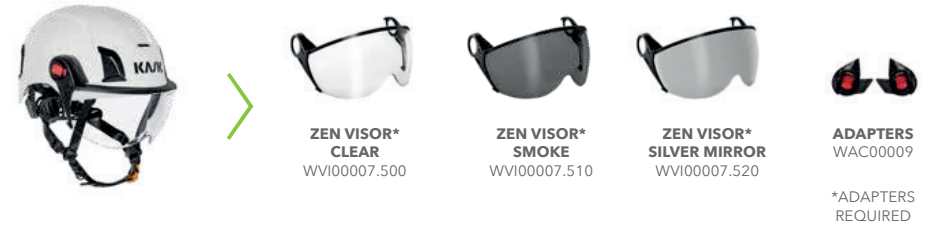
ZEN VISOR* CLEAR WVI00007.500